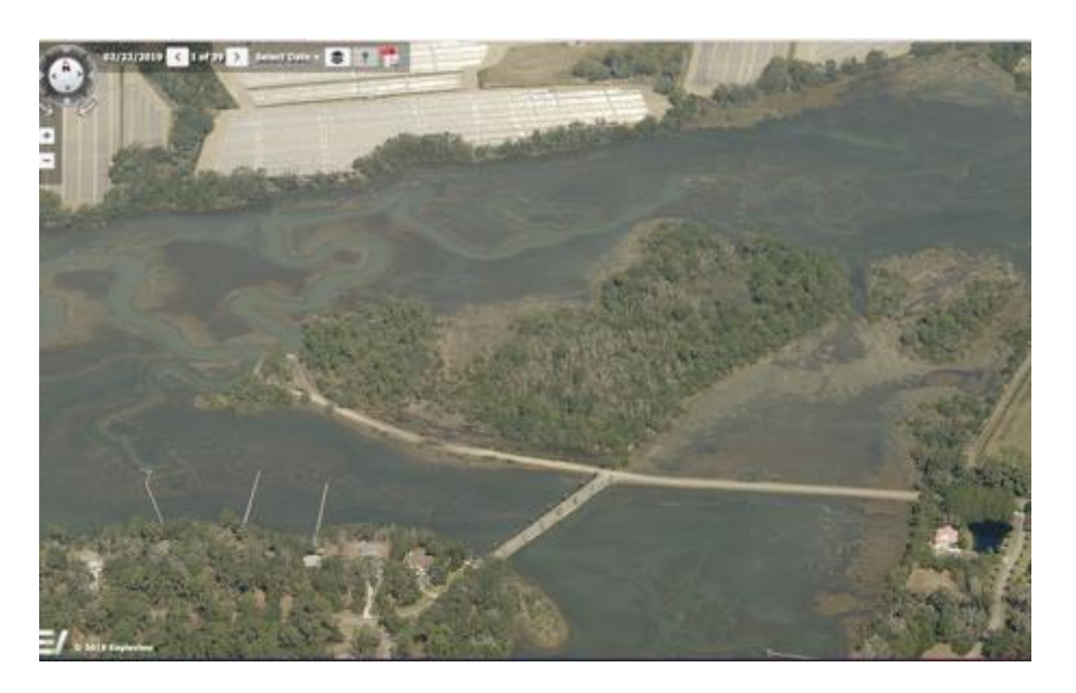
Figure 3: 2019 Aerial image